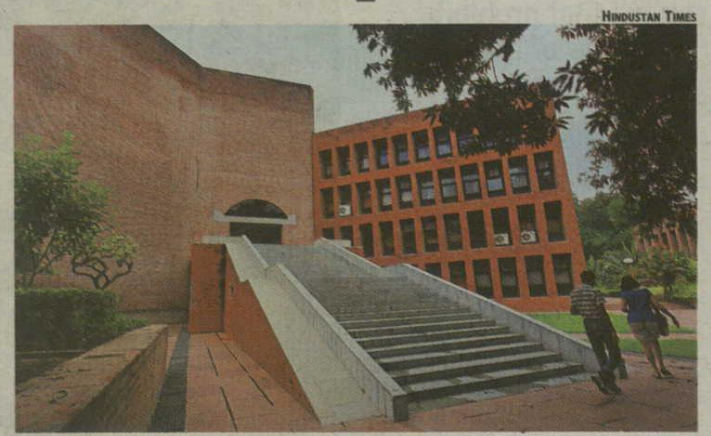
Independent ventures: Eleven students opted out of the placement process to start their own ventures in adventure tourism, data analytics, e-commerce and food processing, among others.

The banking and financial services sector witnessed participation from global investment banks such as Avendus Capital Pvt. Ltd, Citigroup Inc., Credit Suisse AG, Deutsche Bank AG, Goldman Sachs, Hong Kong and Shanghai Banking Corp. Ltd and Nomura. This year, IIM-A also saw participation from private equity and venture capital firms such as Matrix Partners and Apollo Global Manage-